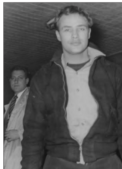
Marlon Brando and unidentified man

around. The set of photos from that day in 1953 turned out great, and over 50 years later they remain some of the very few candid shots from the film to survive.