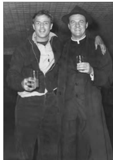
Marlon Brando and Karl Malden