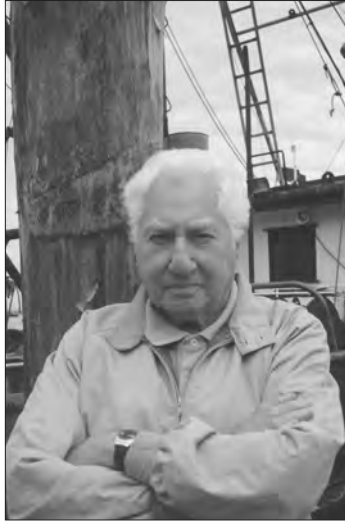
Bud Schulberg on the waterfront.

the New Jersey Council for the Humanities, a state partner for the National Endowment for the Humanities.