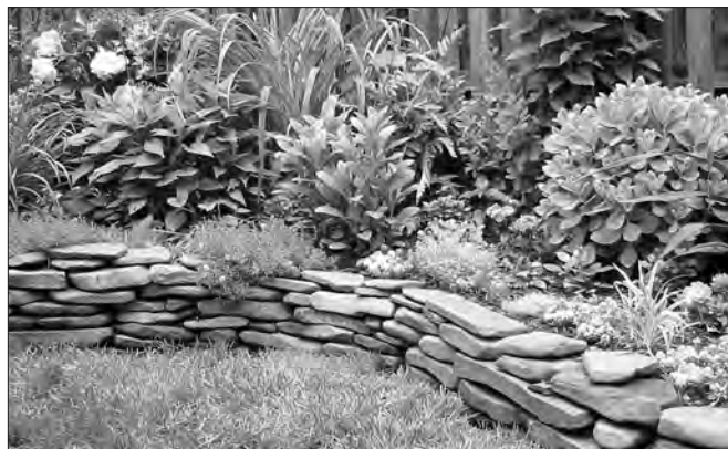
A view of one of last year's gardens.

Tour guides, including some retired longshoremen, will travel with portable DVD players to show clips from the film. Tours leave from the Hoboken Historical Museum, 1301 Hudson Street, at 1 p.m. (don't skip lunch), on May 15, 16, 22, and 23. Tour costs $15/$10 for members of the Hoboken Historical Museum. Tour takers receive a copy of the recent Museum publication, On the Waterfront, Starring Hoboken, New Jersey , with an essay by Sada Fretz. Space is limited. To reserve, please call 201-656-2240, option 2.