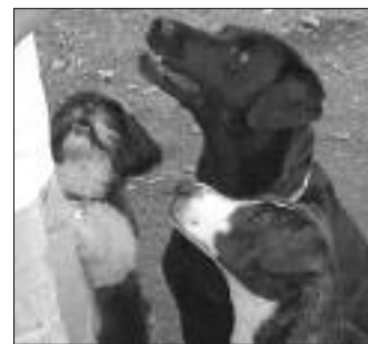
Treat time at Elysian Park dog run from Horses, etc.

Film buffs in Hoboken love to discuss On the Waterfront . After several such discussions, I realized that many of the key sequences in that film take place in parks where we now have dog runs. Hence I decided to include a sequence filmed at dog runs that evokes On the Waterfront .