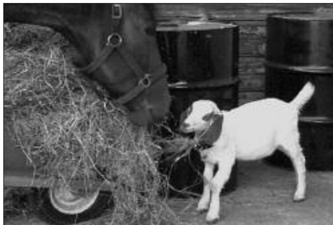
Hoboken Mounted Unit horse with companion goat from the film Horses, etc.