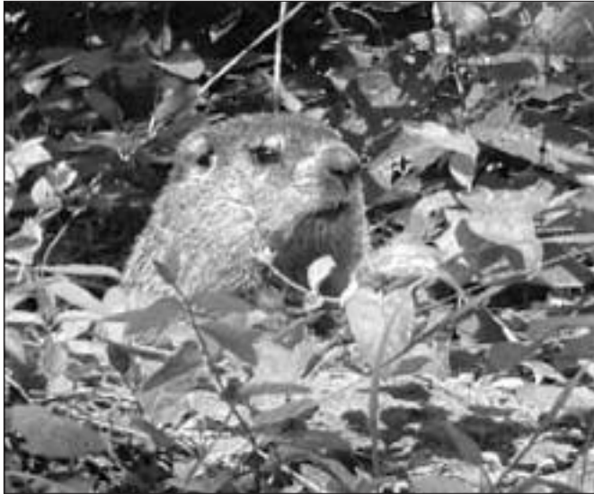
Eighth Street groundhog from Horses, etc.