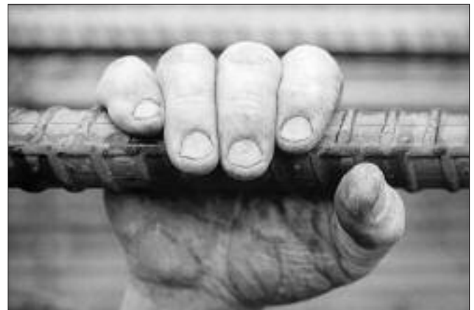
Photograph by Michael Hintlian from Digging: The Workers of Boston’s Big Dig.

If you can’t make these fun-filled special programs, come by anytime. City Animals: Family Activity Guides , including instructions for creating your own paper airplane pigeons, are always available at the entrance of the Museum.