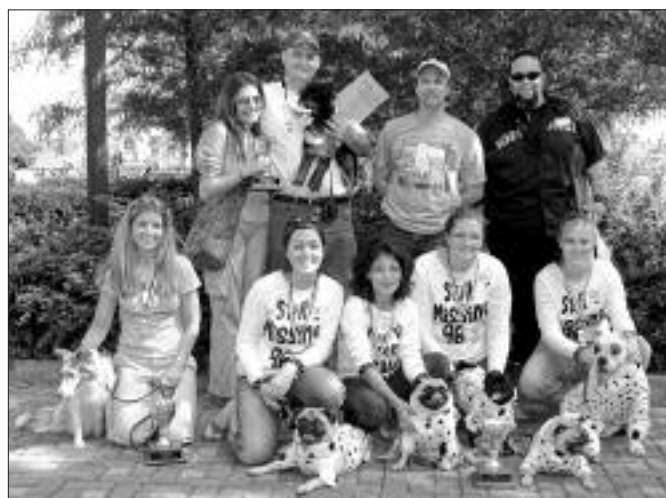
Trophy winners Hoboken Pet Parade.

The illustrated lecture is $5 for members of the Hoboken Historical Museum and $7 for non-members. Seating is limited. Please reserve your place at the Museum, 1301 Hudson Street, by calling 201-656-2240, option 2.