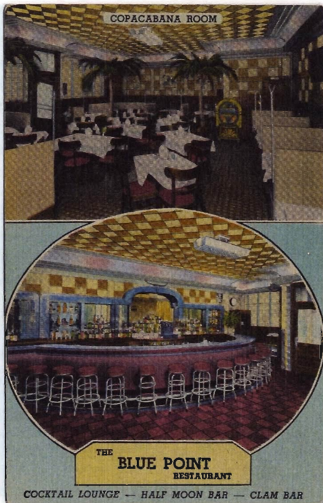
Postcard, Blue Point Lounge, 727 Willow Avenue, Hoboken.

[But] we went out. I don't know what I would have done if she'd said no. I know one thing: I wasn't leavin.' I wasn't going any place.