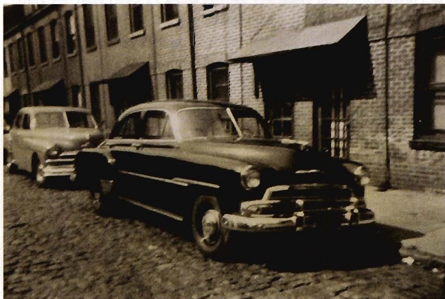
Patsy's car in Willow Terrace, circa 1953.

[We didn't have much to start. When] we moved in it looked like a doctor's office. We had a card table and two chairs. We had jelly jars as glasses. We had a stove [but] we had no refrigerator. We bought just enough food for dinner [because we] couldn't keep it. [Eventually we got a refrigerator.]