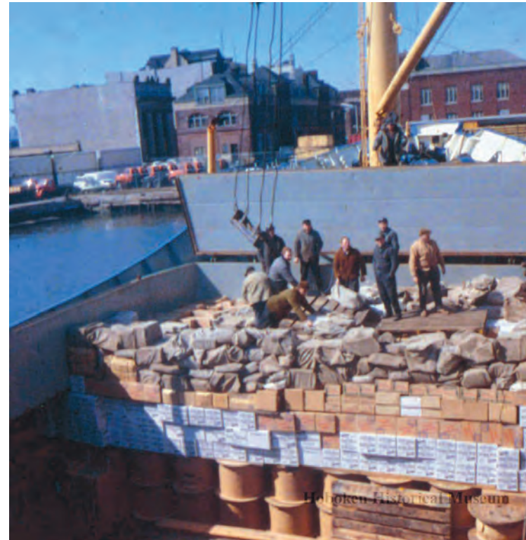
• Longshoremen in the hold of a ship moored on the south side of Pier A, ca. 1970s.