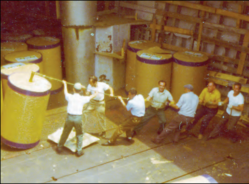
A Project of the Friends of the Hoboken Public Library and the Hoboken Historical Museum