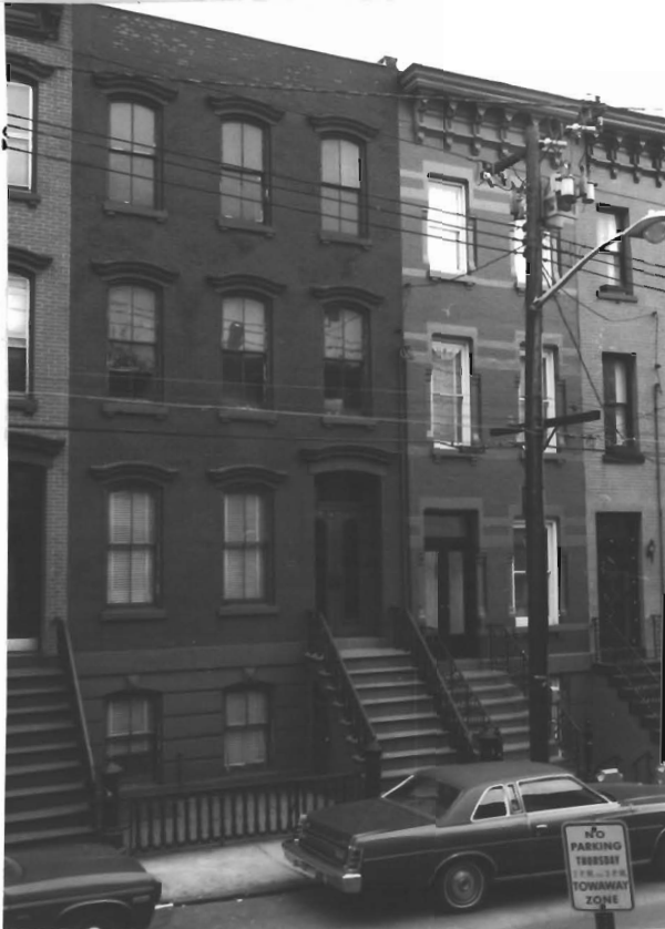
(Bloomfield to Garden Sts.) 159,161 Tenth St. neg. # 32-22