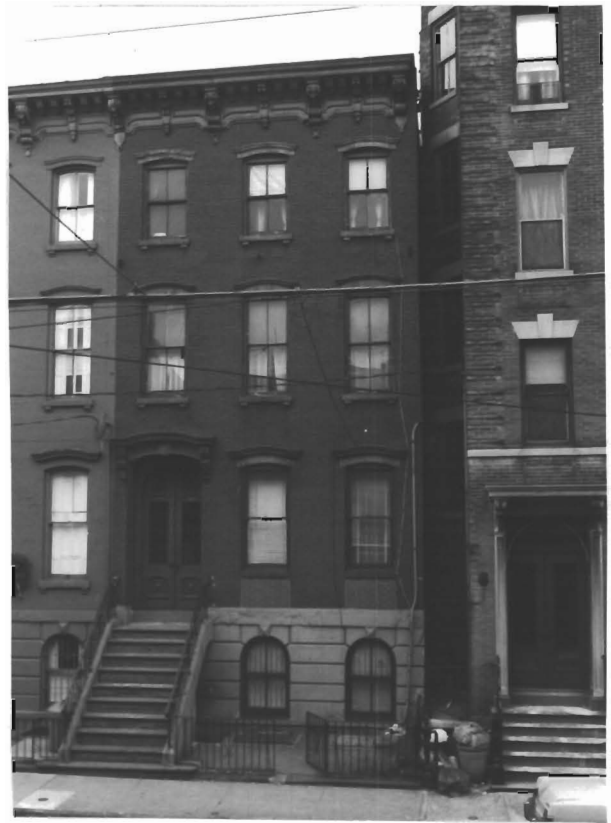
213 Tenth St. neg. # 32-34