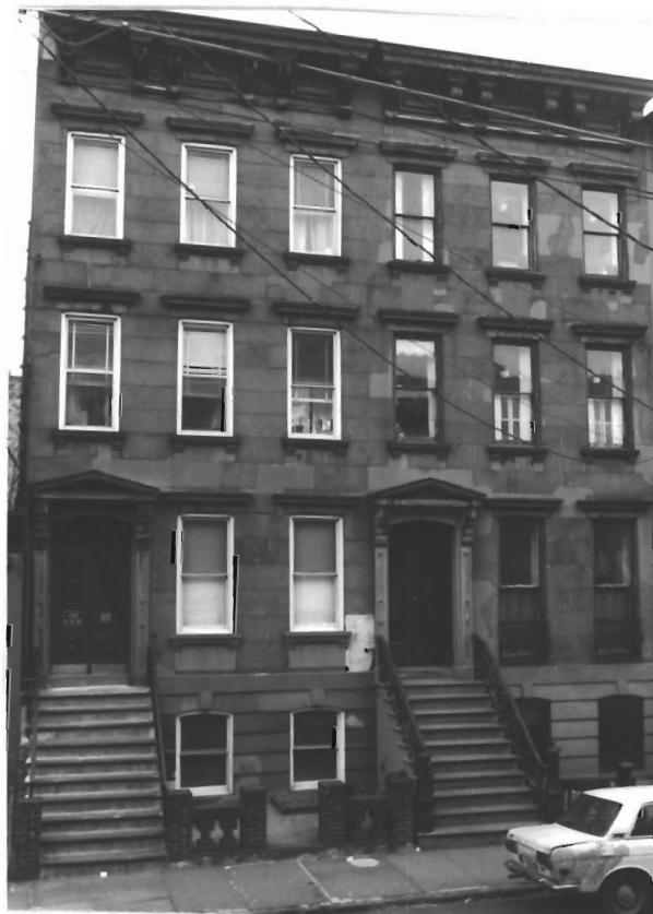
207,209 Tenth St. neg. # 32-32