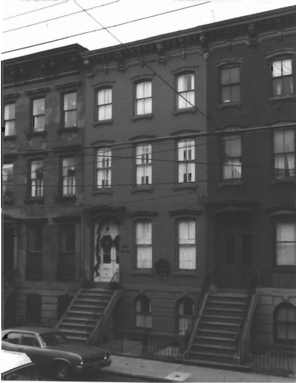
211, 213 Tenth St. neg. # 32-33