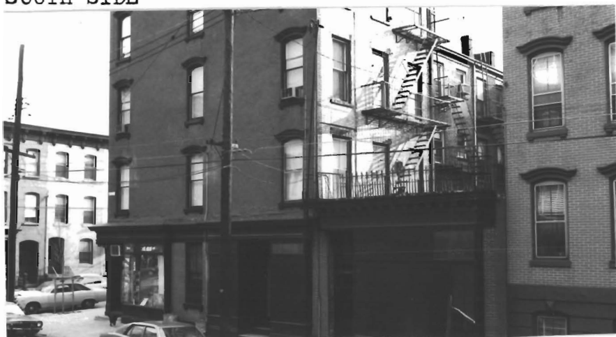
(Bloomfield to Garden Sts.) 151-155 Tenth St. neg. # 32-19