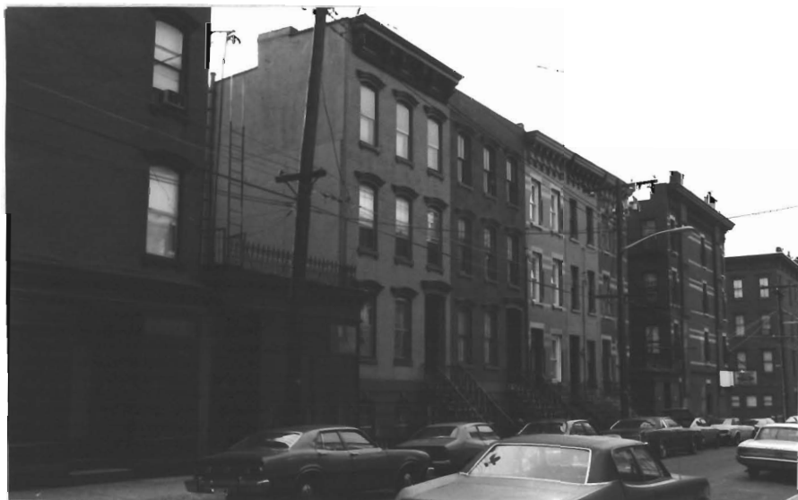
157,159,161,163,165,167 Tenth St. neg. # 32-20