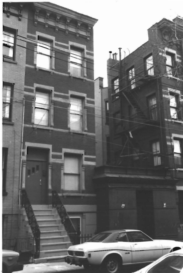
165,167 Tenth St. neg. # 32-24