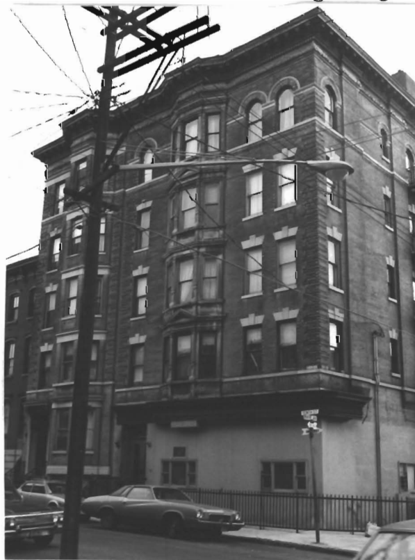
215, 217 Tenth St. neg. # 32-35