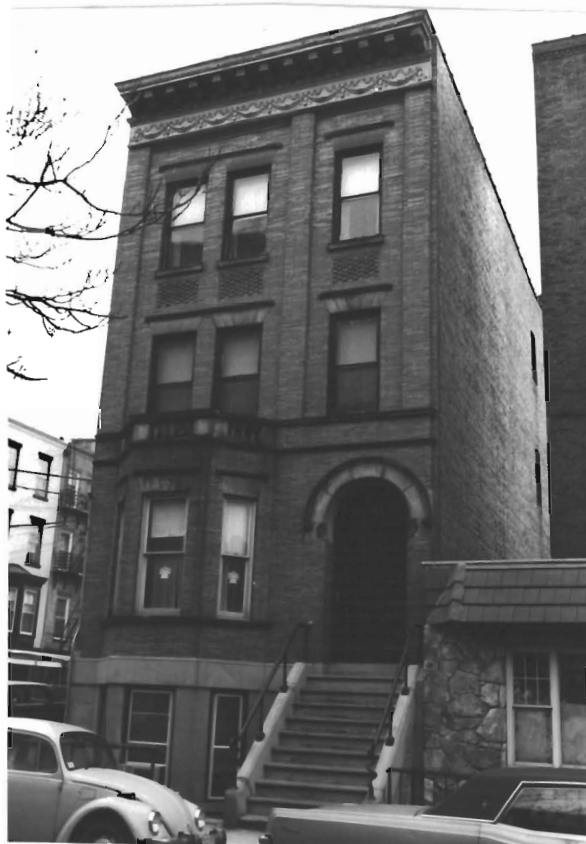
(Hudson to Washington Sts.) 65 Tenth St. neg. # 32-9