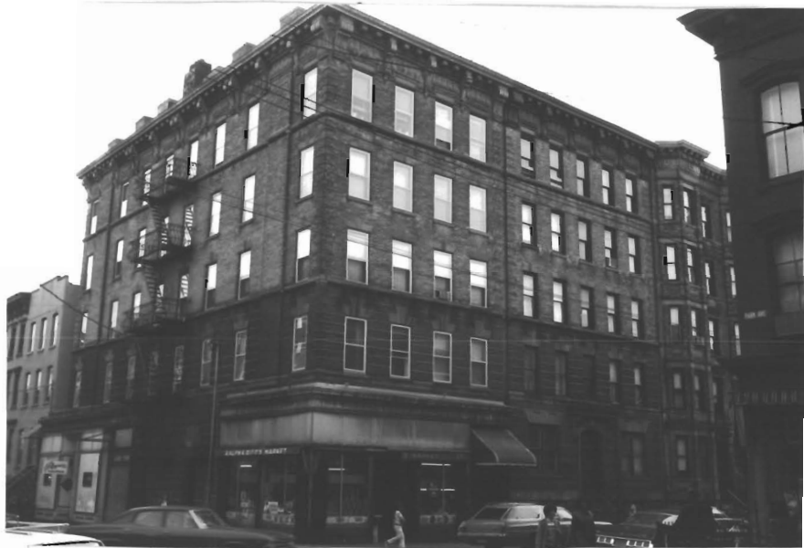
(Park to Willow Aves.) 251,253 Tenth St. neg. # 23-28