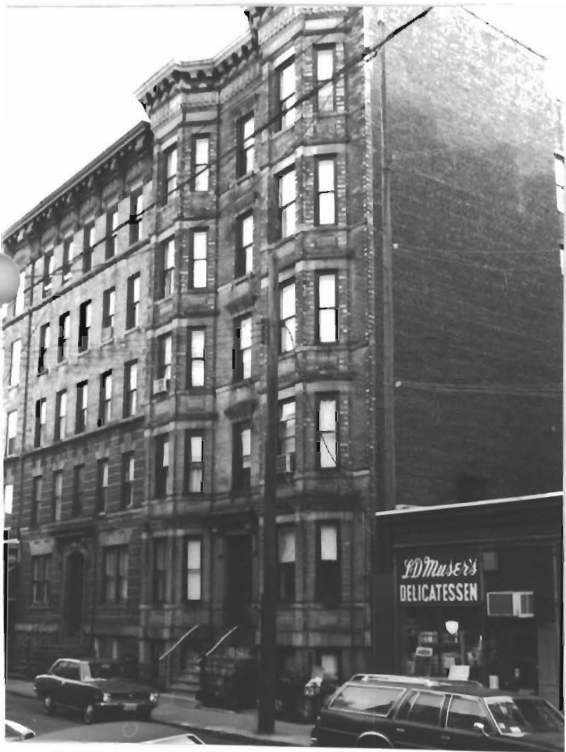
253, 255 Tenth St. neg. # 23-27