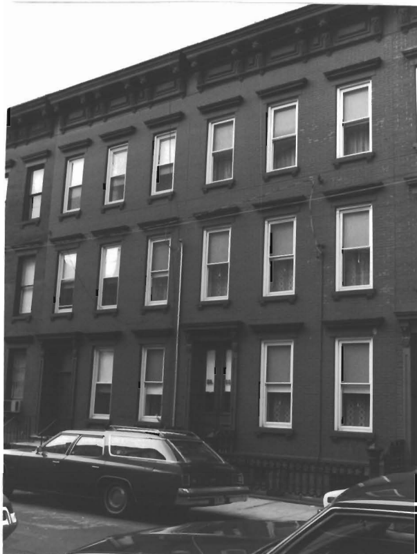
262,260 Tenth St. neg. # 33-5