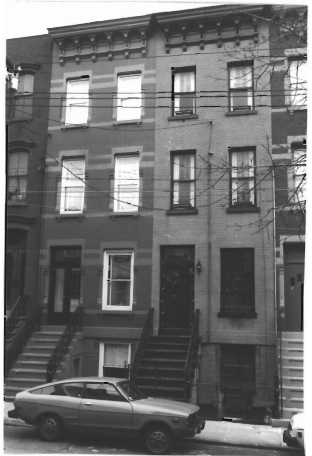
161,163 Tenth St. neg. # 32-23