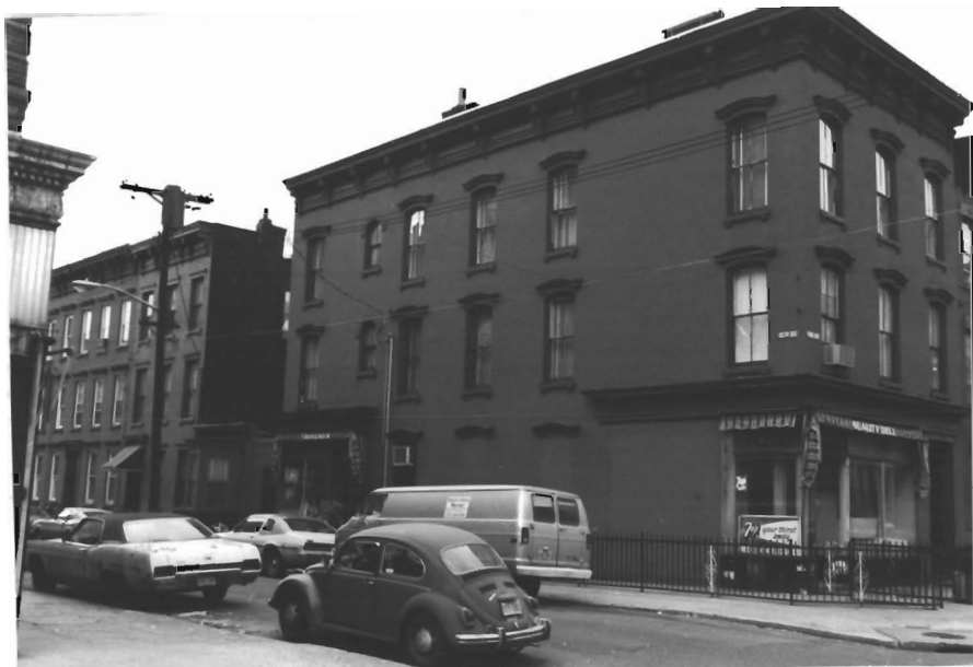
256-250 Tenth St. neg. # 32-37