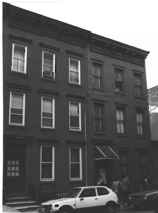
258,256 Tenth St. neg. # 33-4