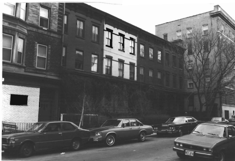
(Hudson to Washington Sts.) 70-64 Tenth St. neg. # 32-3