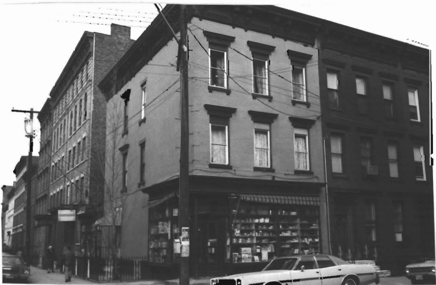
268,264 Tenth St. neg. # 33-6