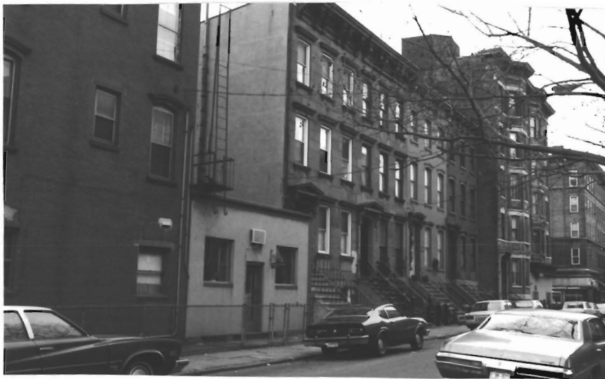
(Garden to Park Ave.) 205-219 Tenth St. neg. # 32-31