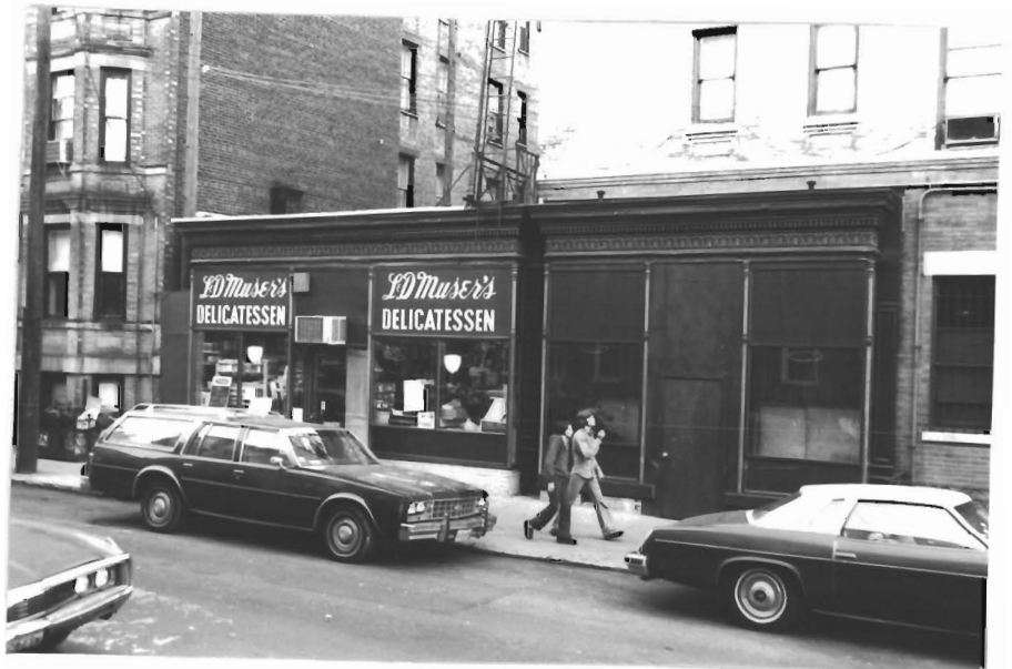
257 Tenth St. neg. # 23-26