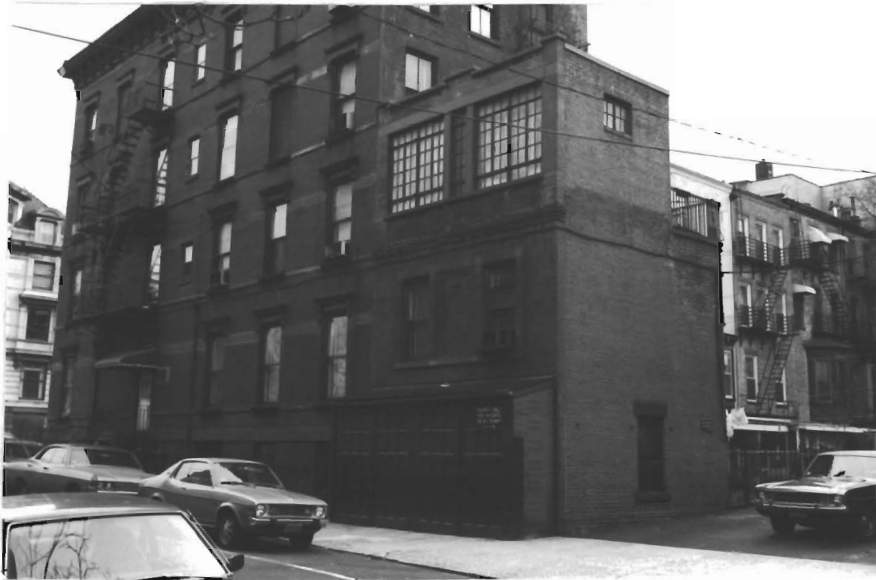
(Hudson to Washington St.) 51-63 Tenth St. neg. # 32-7