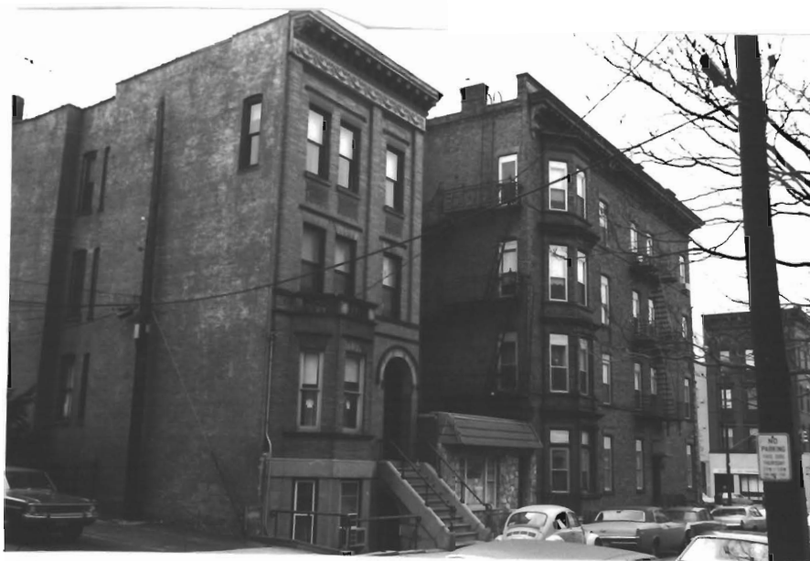
65,67 Tenth St. neg. # 32-8