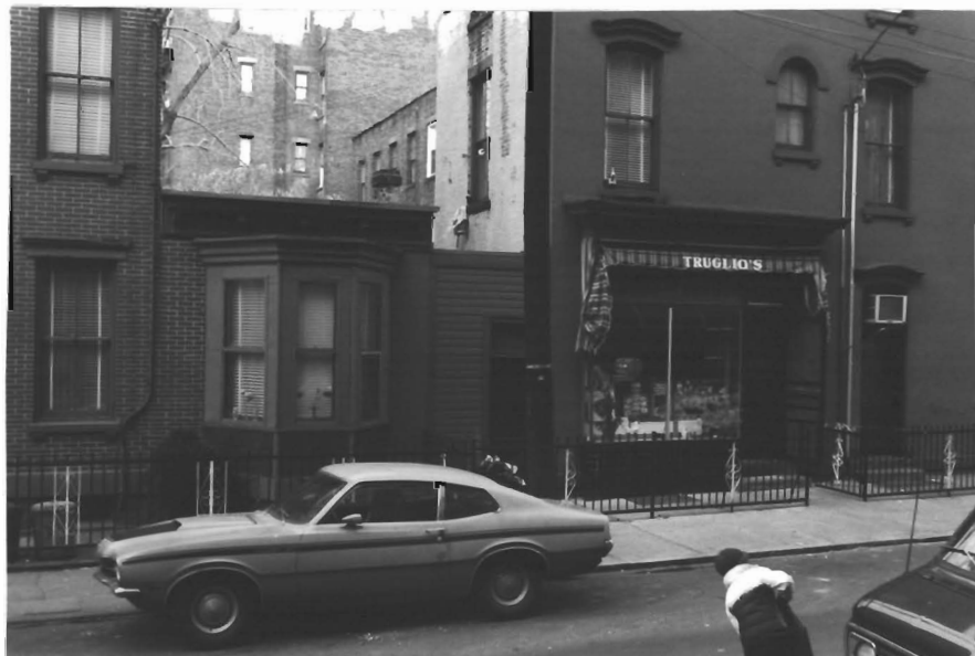
254,252 Tenth St. neg. # 33-3