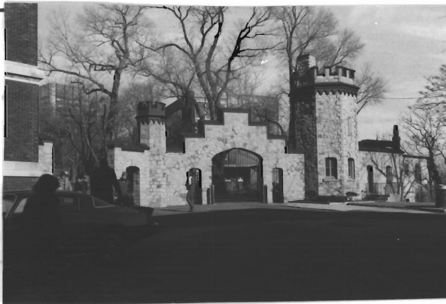
MAP (Indicate North)

A fanciful use of castellation on a small round arched gateway that once led to the Stevens Mansion on Castle Point. The stone is indigenous to Hoboken.