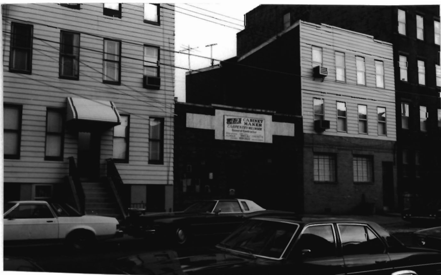
225,223 Clinton St. neg. # 39-19