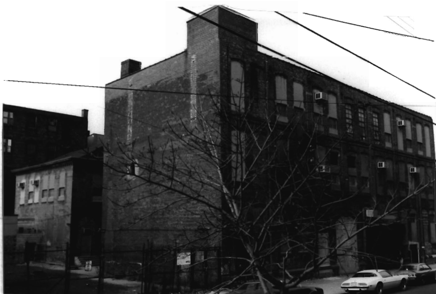
222-224 (vacant), 226-32 Clinton St. neg. # 28-31