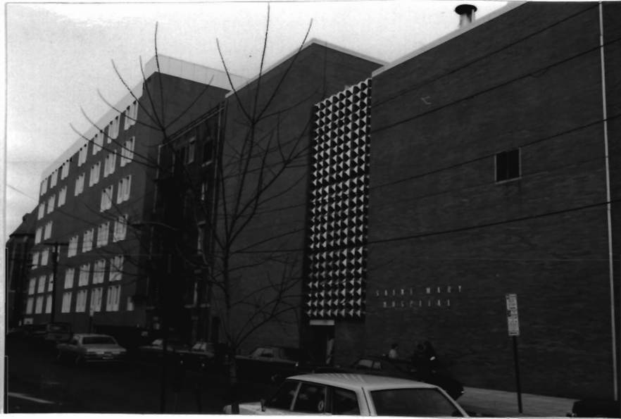
331-307 Clinton St. neg. # 39-21