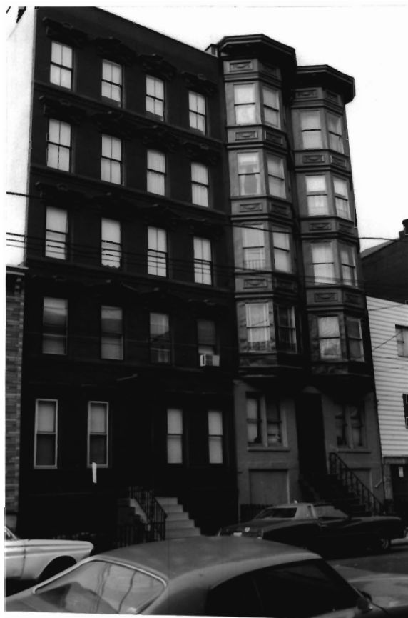
116, 118 Clinton St. neg. # 28-27