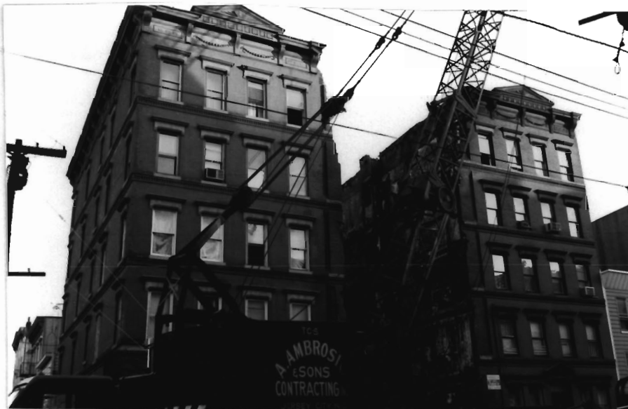
1033, 1029 (1931, burned) Clinton St. neg. # 39-11