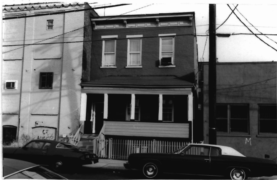
1039,37,35 Clinton St. neg. # 23-7