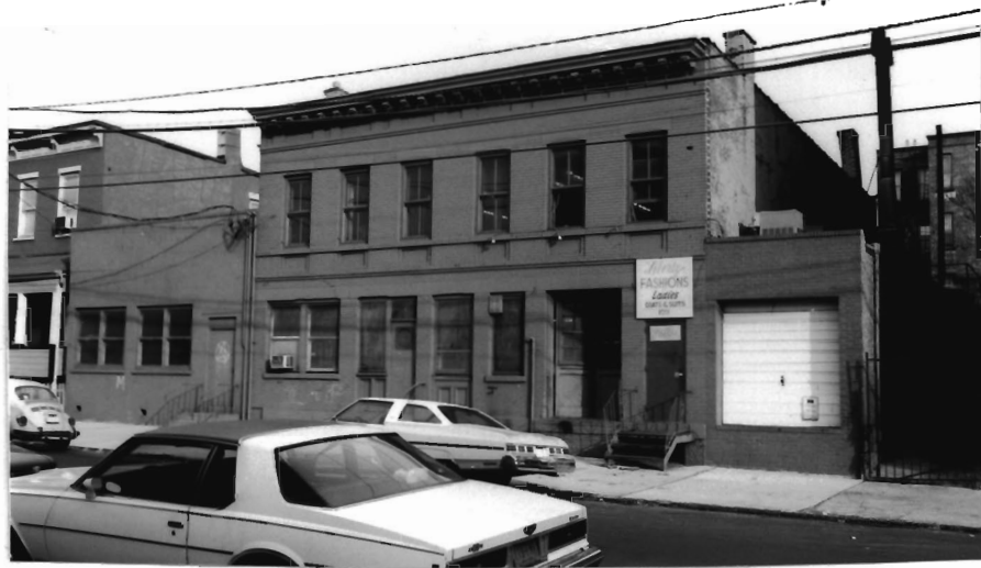
1035, 1033-29 Clinton St. neg. # 23-6