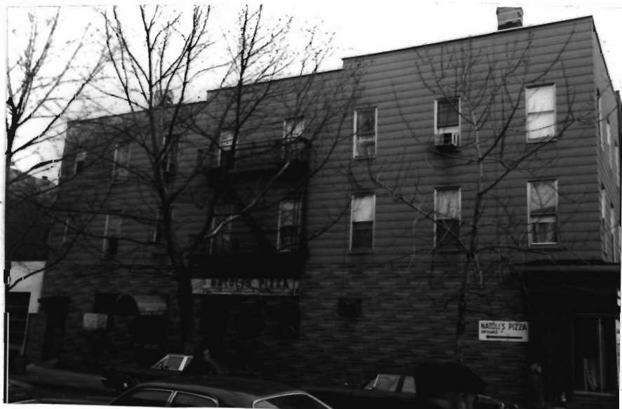
205-201 Clinton St. neg. # 39-14