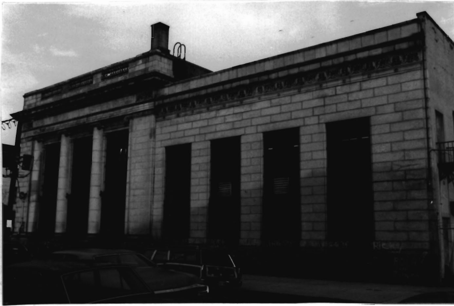
99-93 Clinton St. neg. # 39-__