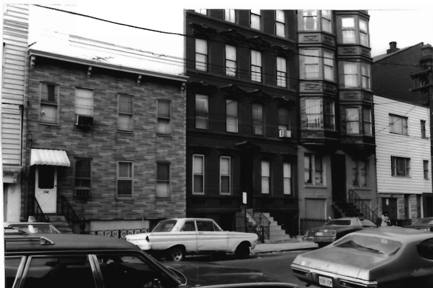
114, 116, 118, 120 Clinton St. neg. # 28-26