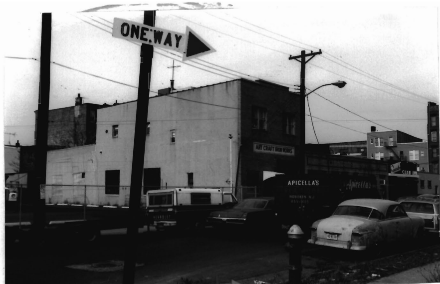
(Newark to First Sts.) 82-84(vacant), 86, 88-90, 92-94 Clinton St. neg. # 28-22