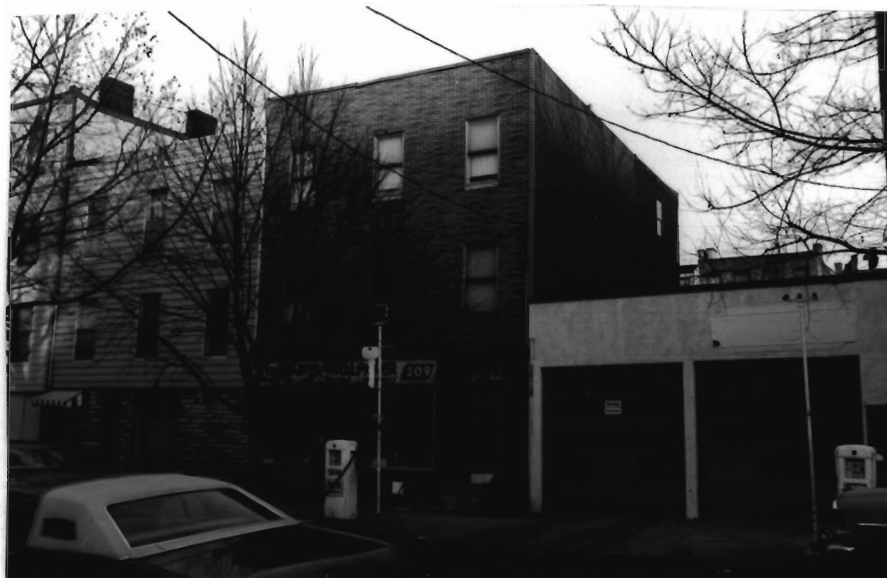
211, 219, 207 Clinton St. neg. # 39-15