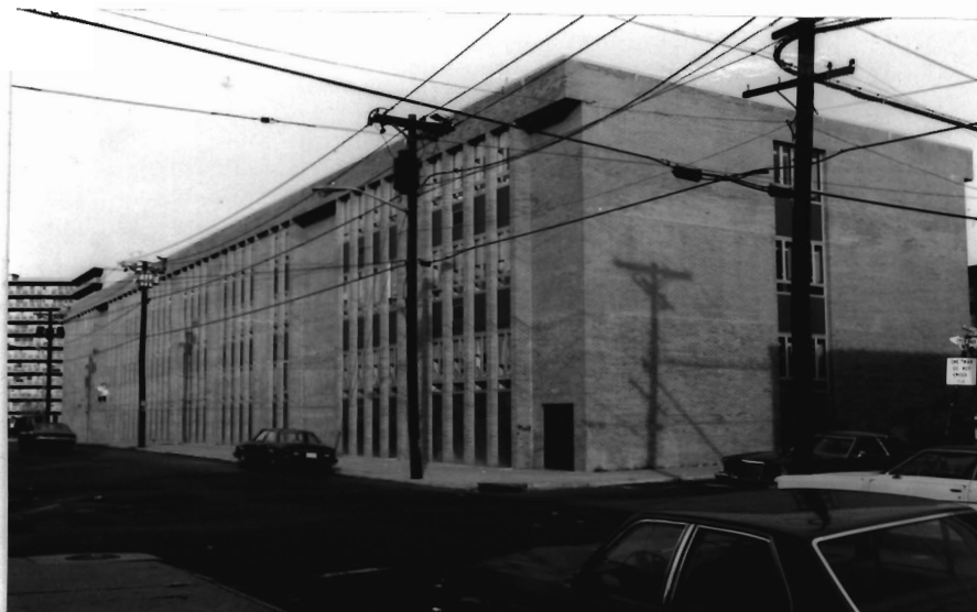
1101 Clinton St. (Wallace Public School) neg. # 23-9