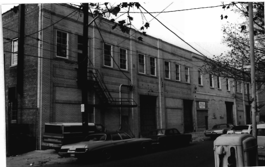
208-212,14-16,18-20 Clinton St. neg. # 28-30