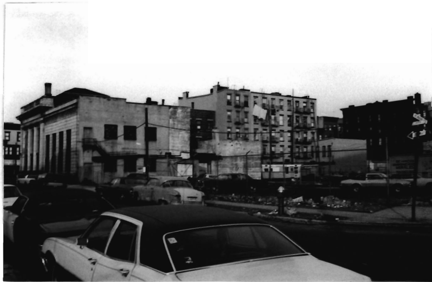
99-81 Clinton St. neg. # 39-3