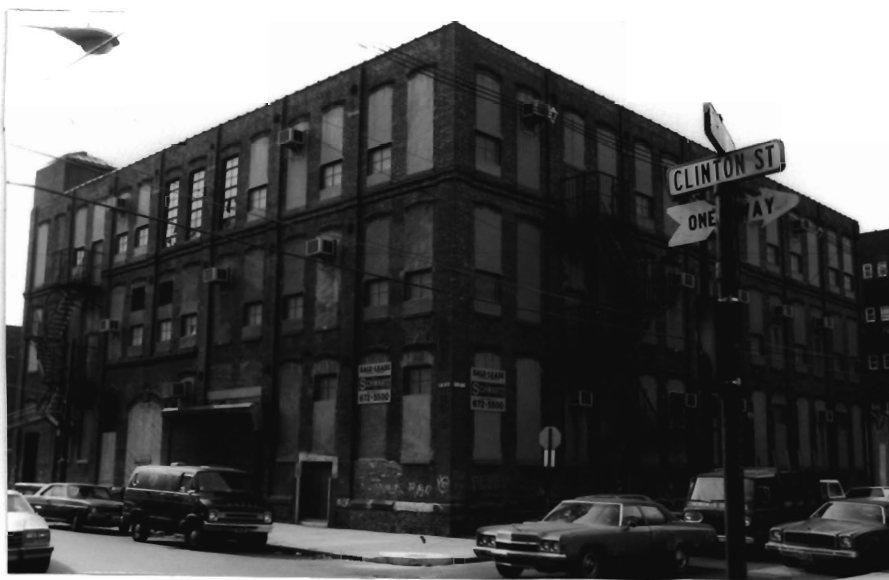
226-32 Clinton St. neg. # 28-32