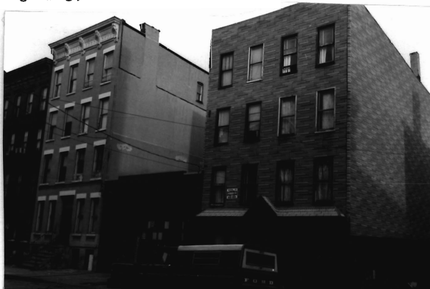
1025,23,21,19 Clinton St. neg. # 39-9