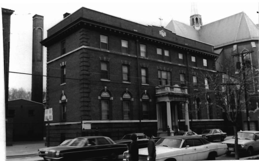
417-413 Clinton St. (Our Lady of Grace Convent) neg. # 21-16