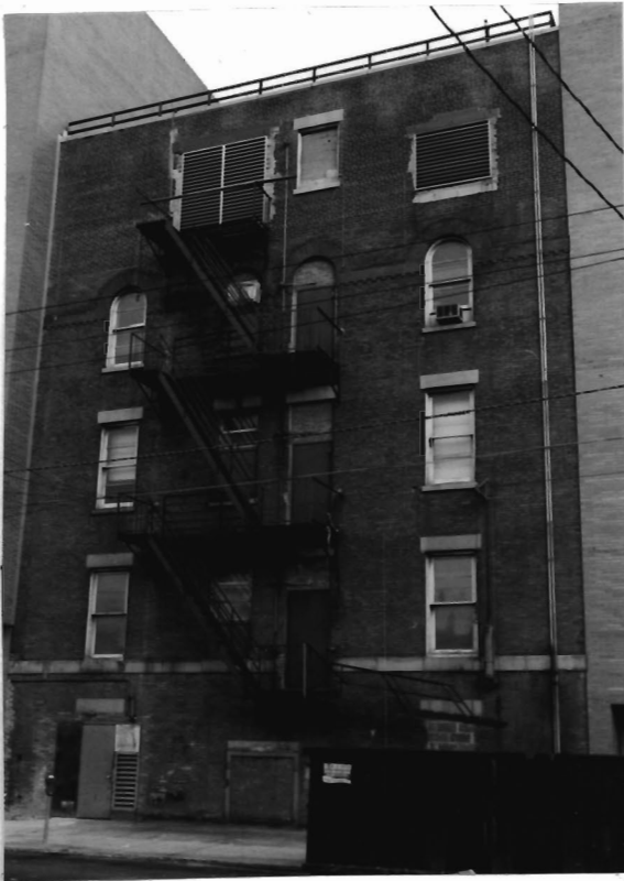
325-323 Clinton St. neg. # 39-22