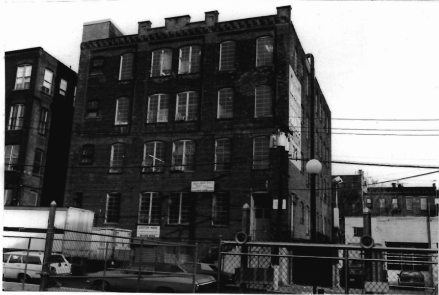
1021-1015 Clinton St. neg. # 23-4