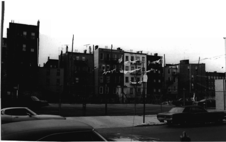
312 Clinton St. neg. # 29-4