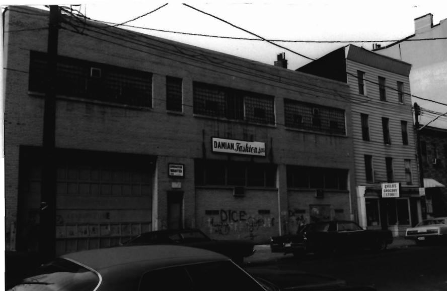
106-10,112 Clinton St. neg. # 28-25