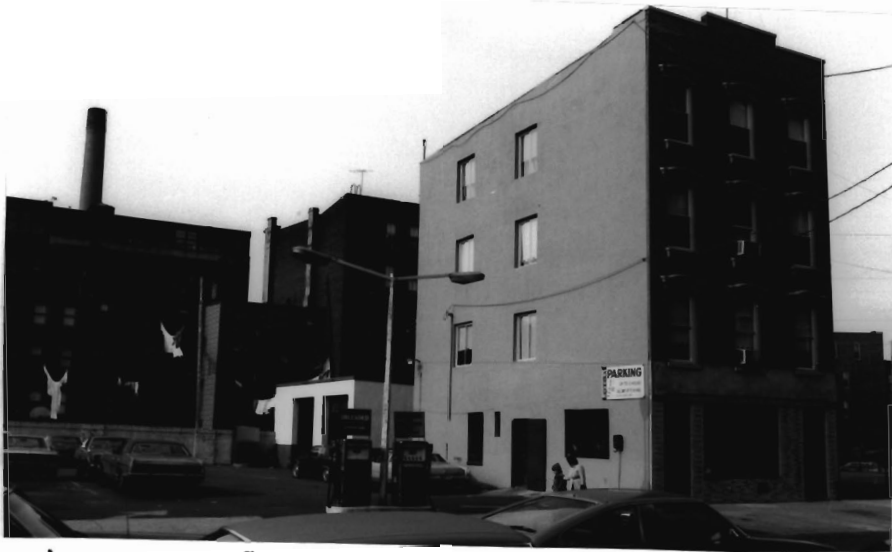
314 Clinton St. neg. # 29-5