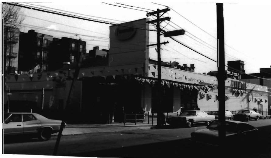
821,811 Clinton St. neg. # 38-34