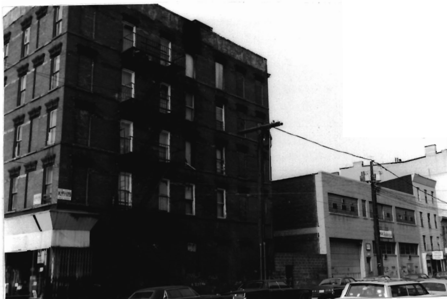
100-02,04,06-10,12,14 Clinton St. neg. # 28-24