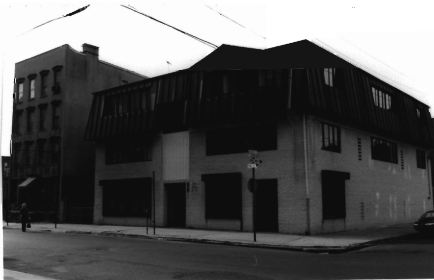
326, 330 Clinton St. neg. # 29-7