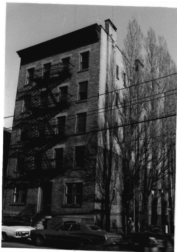
831 Clinton St. neg. # 38-33