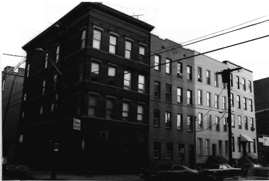
233,231,229,227 Clinton St. neg. # 39-18