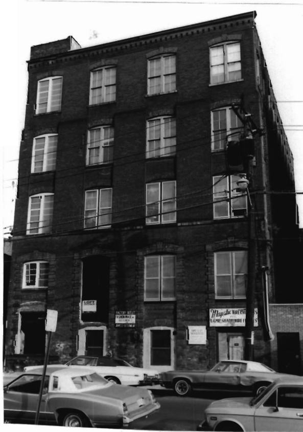
1027-1023 Clinton St. neg. # 23-5