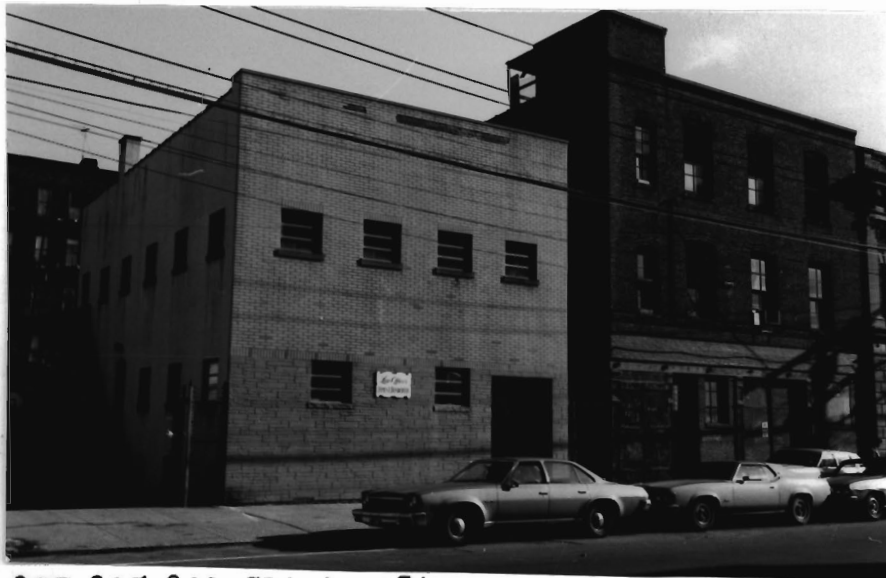
807,805-803 Clinton St. neg. # 38-35