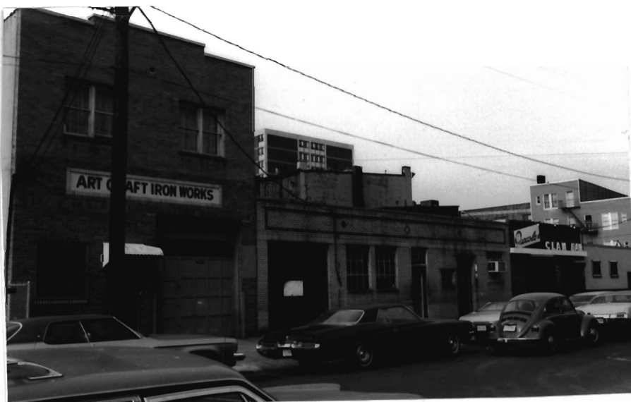
96-98, 86, 88-90, 92, 94 Clinton St. neg. # 28-23