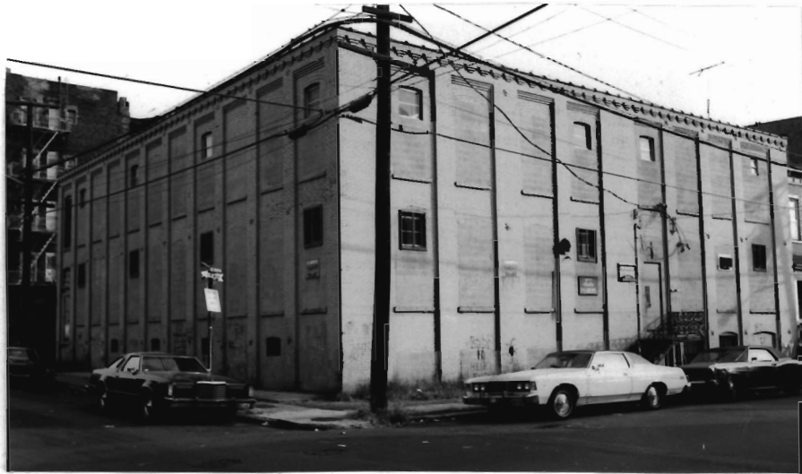
1043-1039 Clinton St. neg. # 23-8