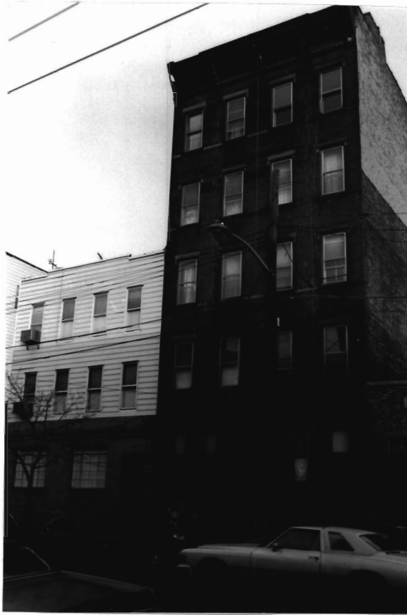
223,221 Clinton St. neg. # 39-17