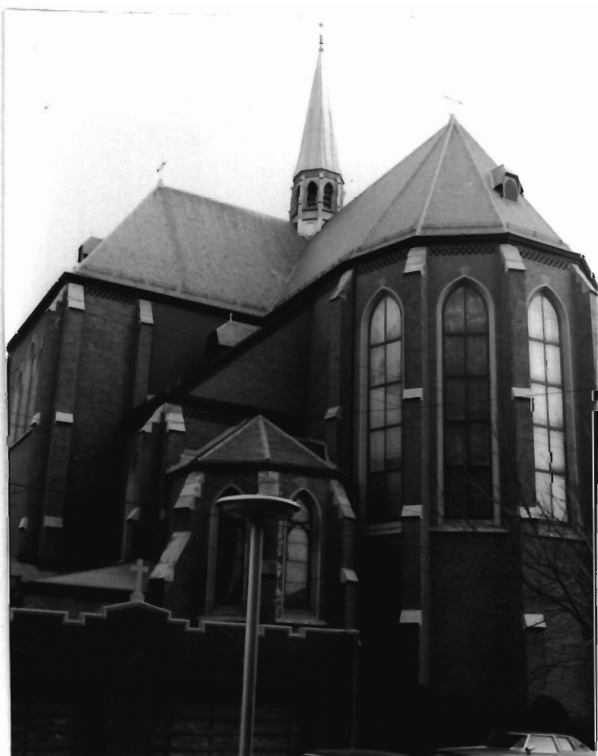
401 Clinton St. (Our Lady of Grace Roman Catholic Church) 21-17