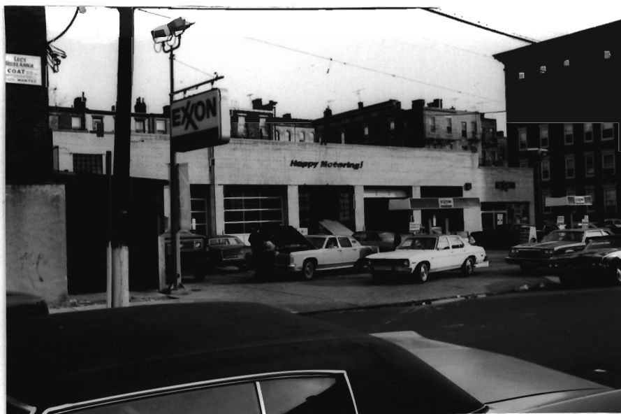
1013-1001 Clinton St. neg. # 23-3