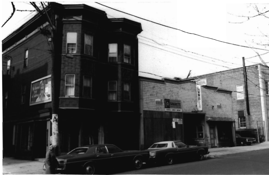
200,202,204,206 (vacant) Clinton St. neg. # 28-29