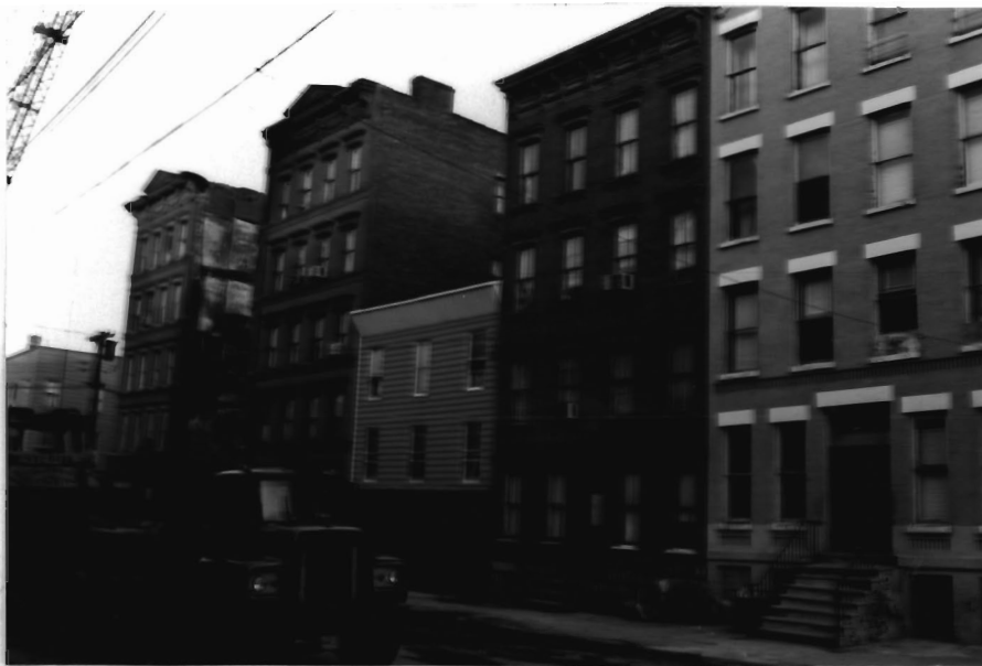
1031,29,27,25,23 Clinton St. neg. # 39-10