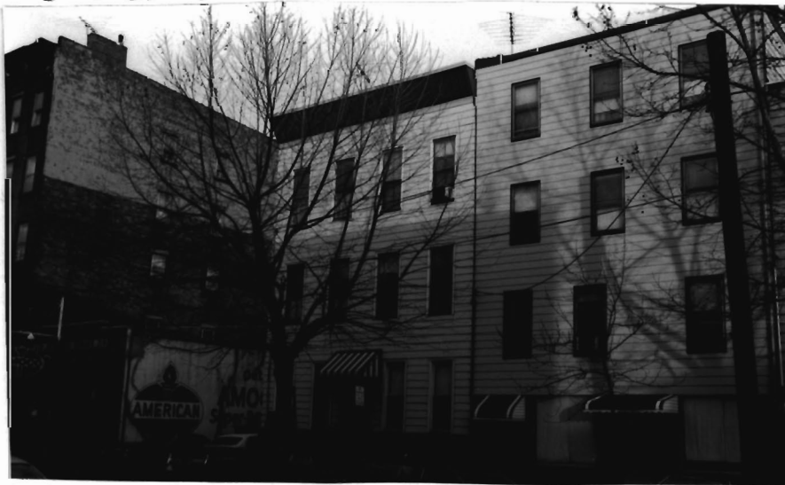
219-17,215,213 Clinton St. neg. # 39-16