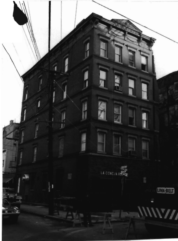
1033 Clinton St. neg. # 39-13