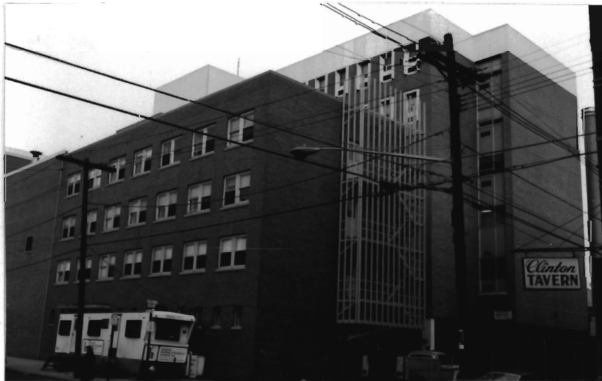
307-301 Clinton St. neg. # 39-20