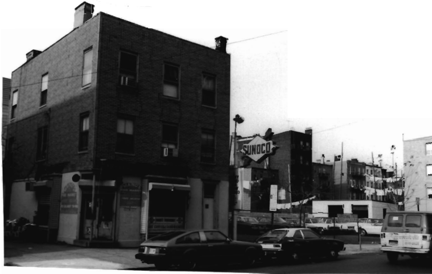
300,302-12 (parking) Clinton St. neg. # 29-1