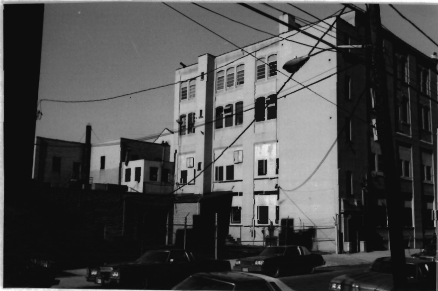
322-324,326-330 Jefferson St. neg. # 37-14