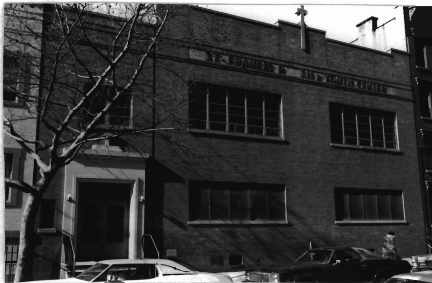
(St. Francis Polish Youth Center) 312-314 Jefferson St. neg. # 37-12