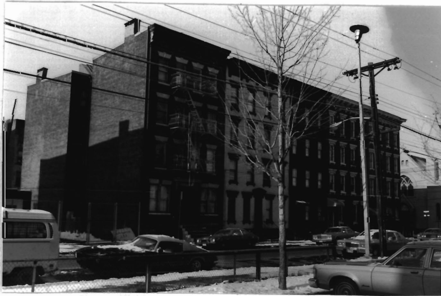
224, 226, 228, 230, 232 Jefferson St. neg. # 34-35