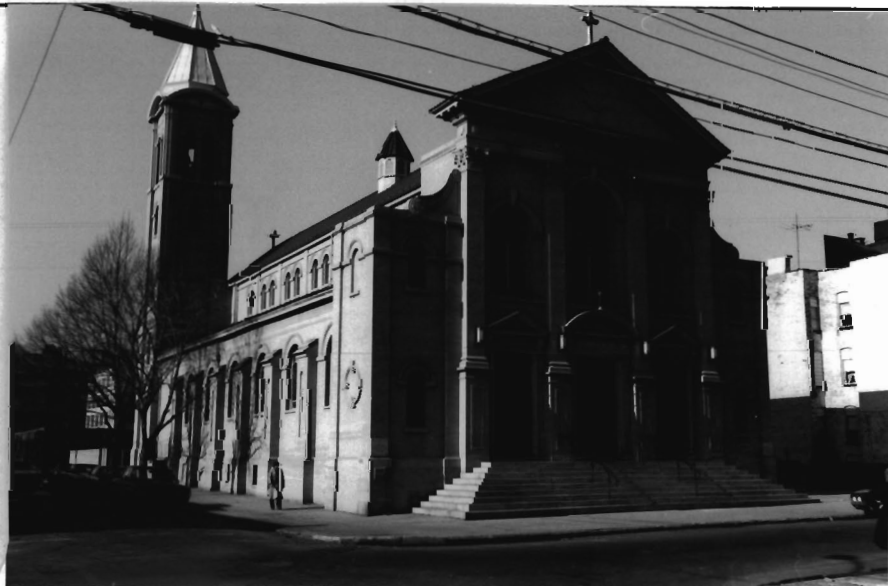
Map (Indicate North)

Interior features Italian marble, and hand painted murals.