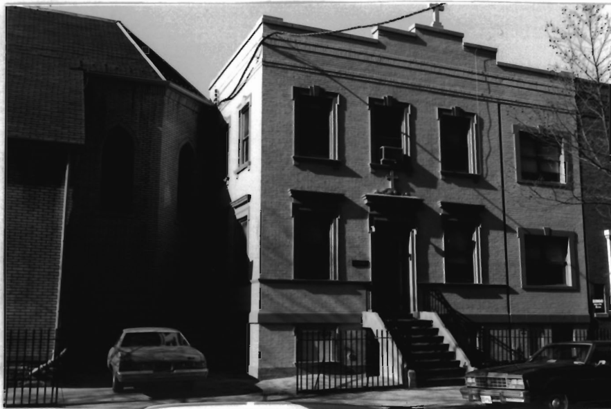
(St. Francis Friary) 308-310 Jefferson St. neg. # 37-4