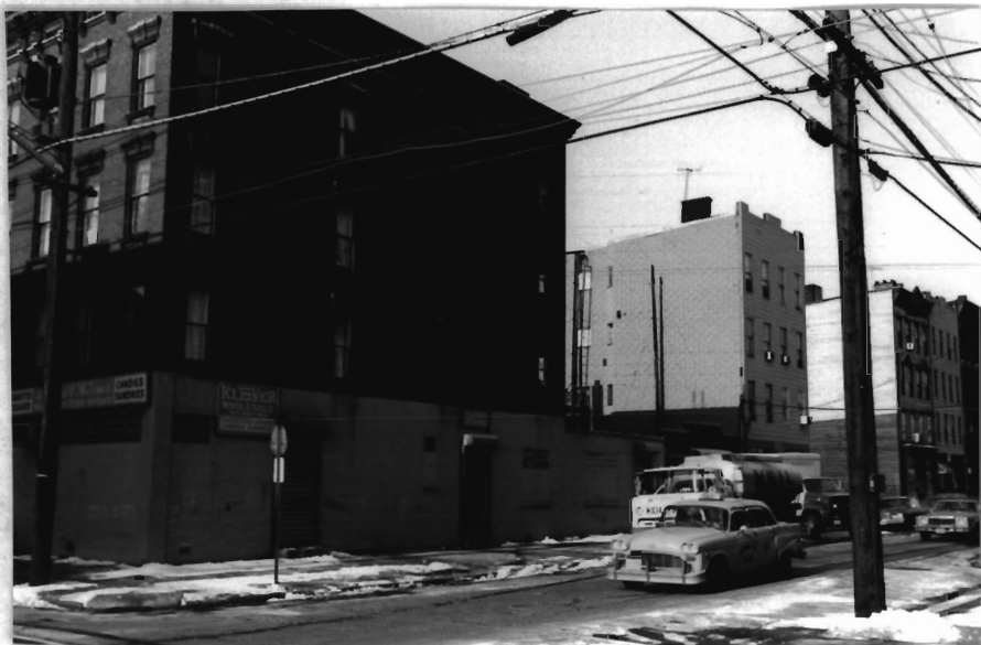
200-204, 206, 208, 212, 214, 216 Jefferson St. neg. # 34-32