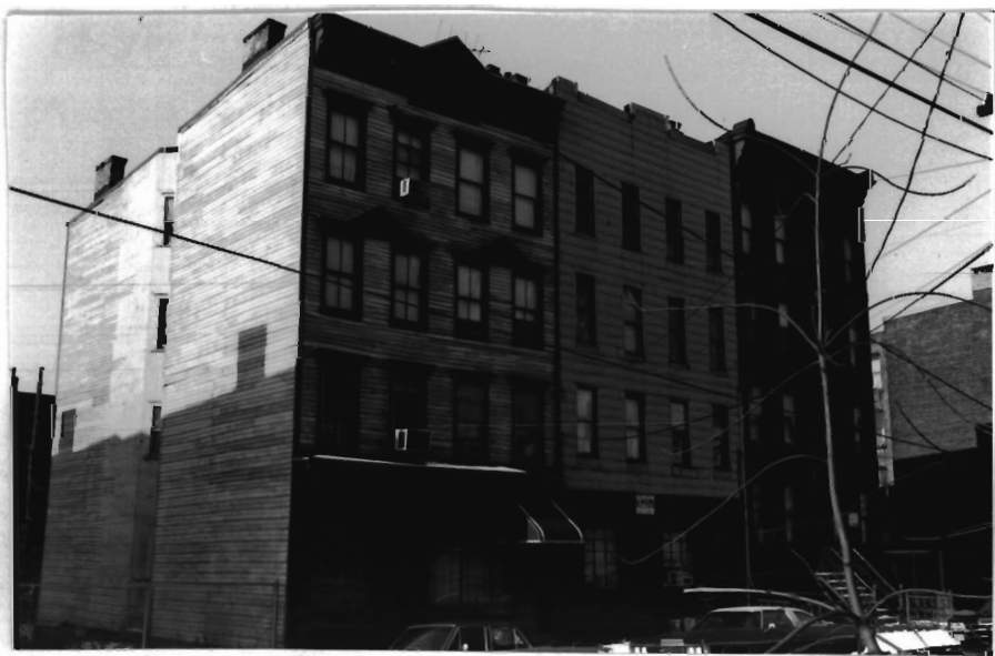
214, 216, 218 Jefferson St. neg. # 34-33