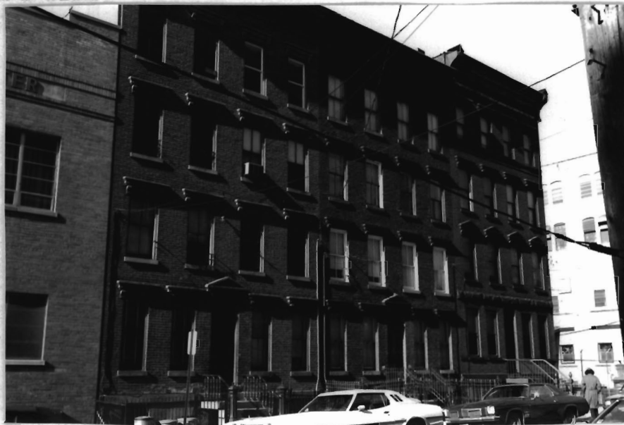
316,318,320 Jefferson St. neg. # 37-13