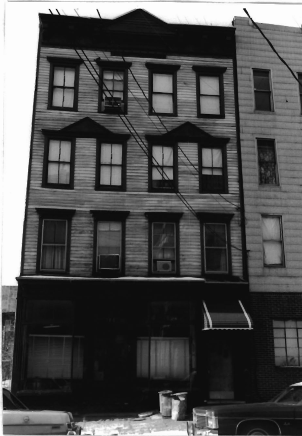
214 Jefferson St. neg. # 34-34