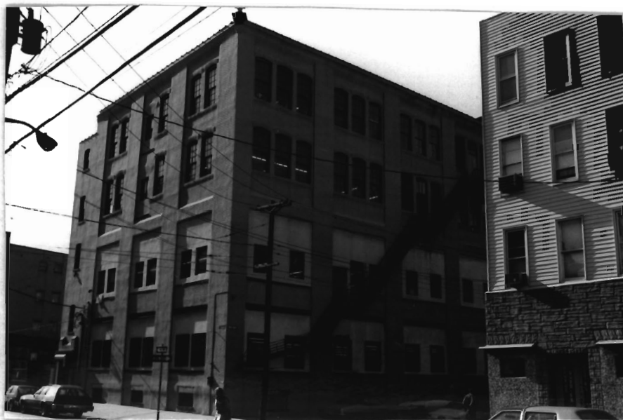
326-330 Adams St. neg. # 37-15