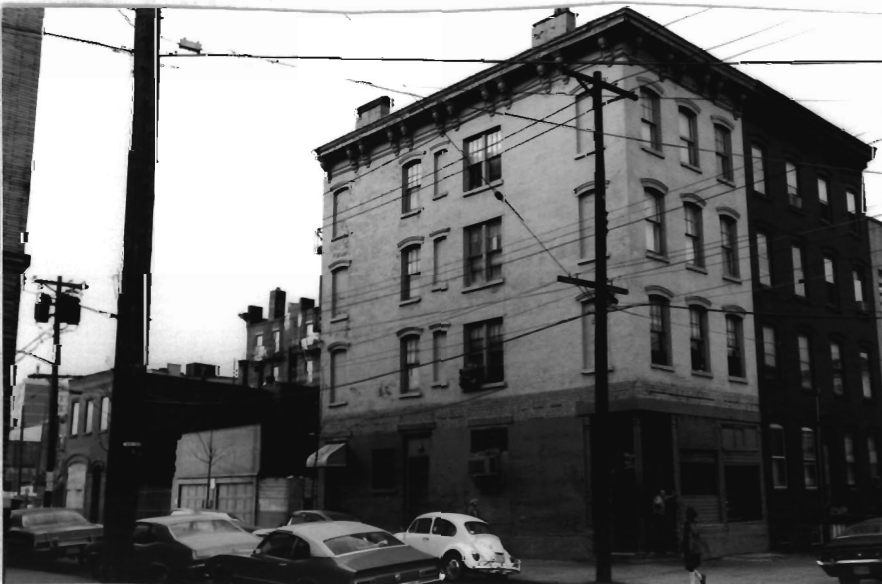
256-250 Newark St. neg. # 20-13