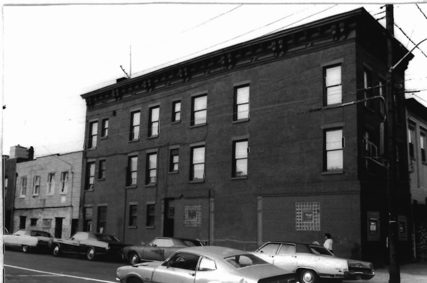
206,204-200 Newark St. neg. # 20-8