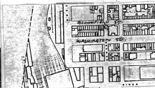
MAP (Indicate North)

Additional Architectural Description: Ground floor has limestone trim, fluted Doric pilasters with entasis, forming a support for an inscribed entablature. The windows feature slender cast-iron columns as supports and enframement. The underlying structure is expressed subtly by the projecting piers between bays; below the cornice, the termination of the piers is set off by horizontal brick coursing. The basement facade on Newark street has been filled with cinderblocks in a diamond-shaped pattern, and cement and pebble finish has been given to the area surrounding the original entry, which was converted into a window. Aside from these changes, the building, with its slightly projecting cast-iron cornice with modillions, maintains a prominent position on the corner.