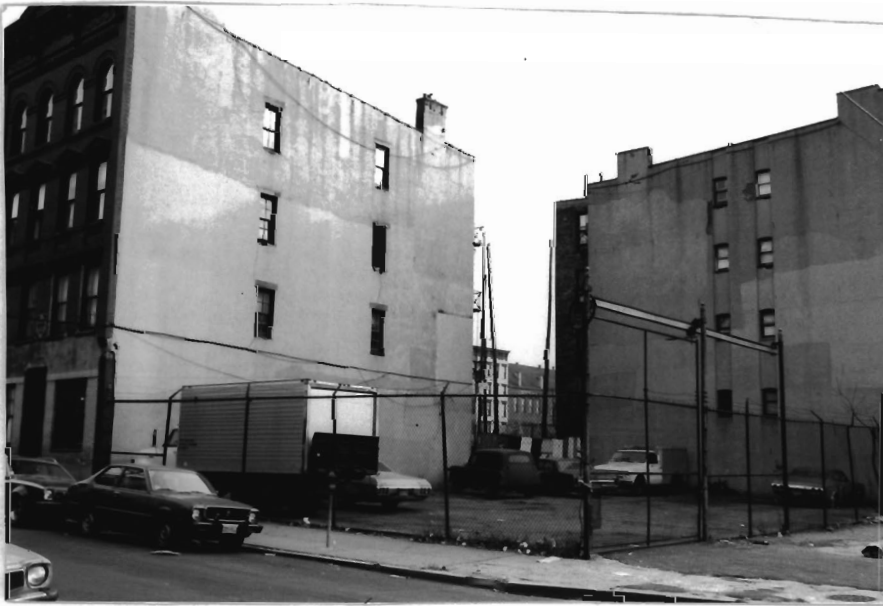
163 (vacant) Newark St. 20-7