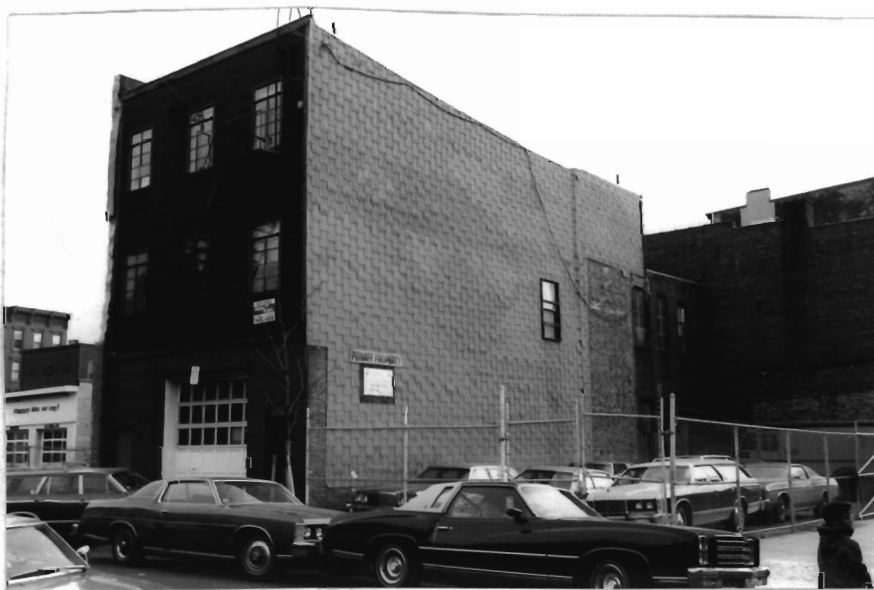
213,215(parking) Newark neg. # 20-12