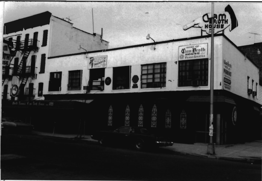
Map (Indicate North)

A cornice-like band runs above wood panelled 1st storey corner entry.