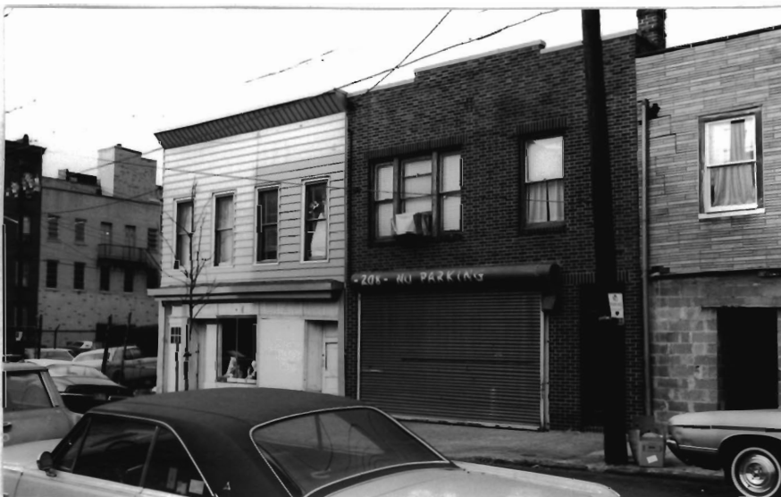
210,208 Newark St. neg. # 20-9