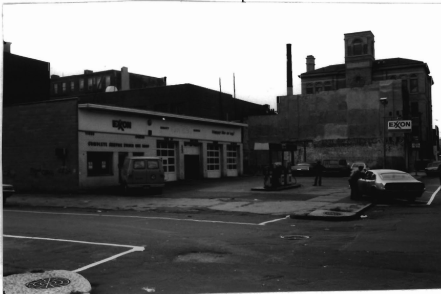
201-211 Newark St. neg. # 20-11