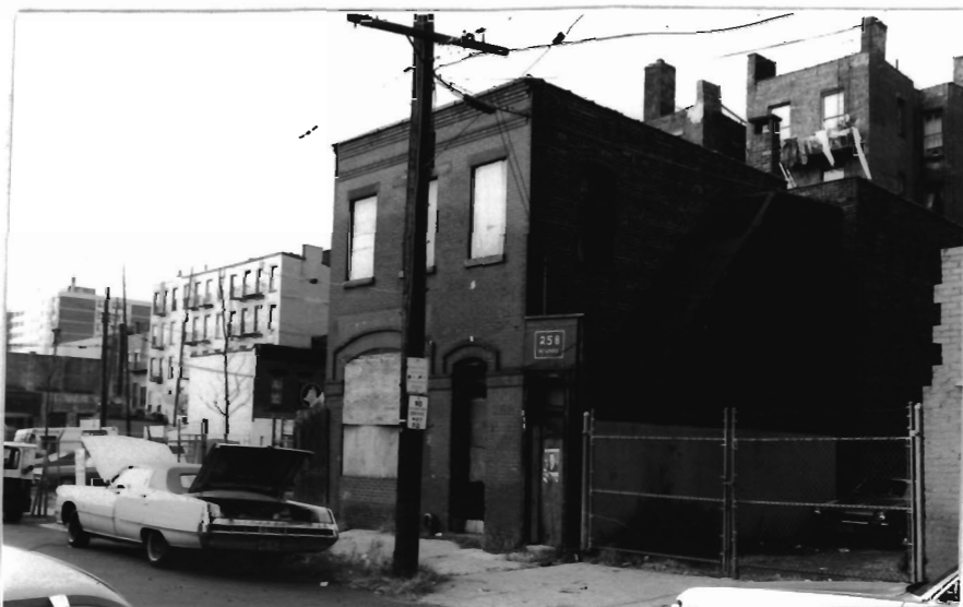
258, 256 Newark St. neg. # 20-14