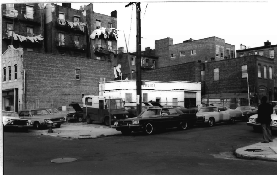
264-260, 258 Newark St. neg. # 20-15