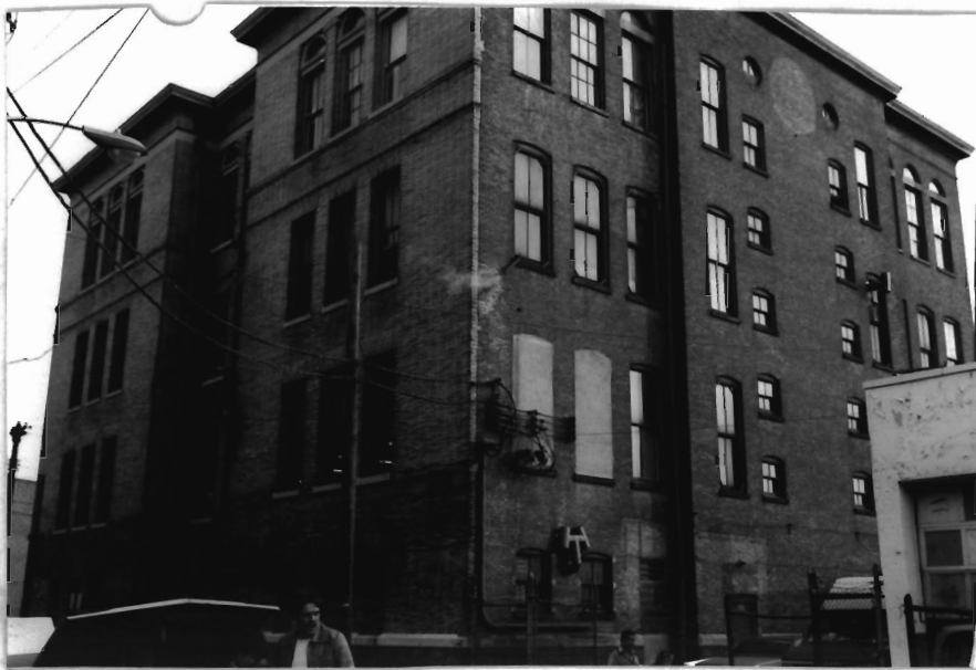
251-259 Newark St. neg. # 20-16