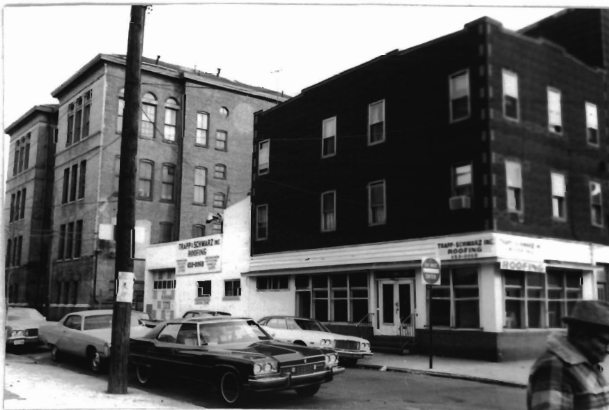
261 Newark & 83 Willow Sts. neg. # 20-17