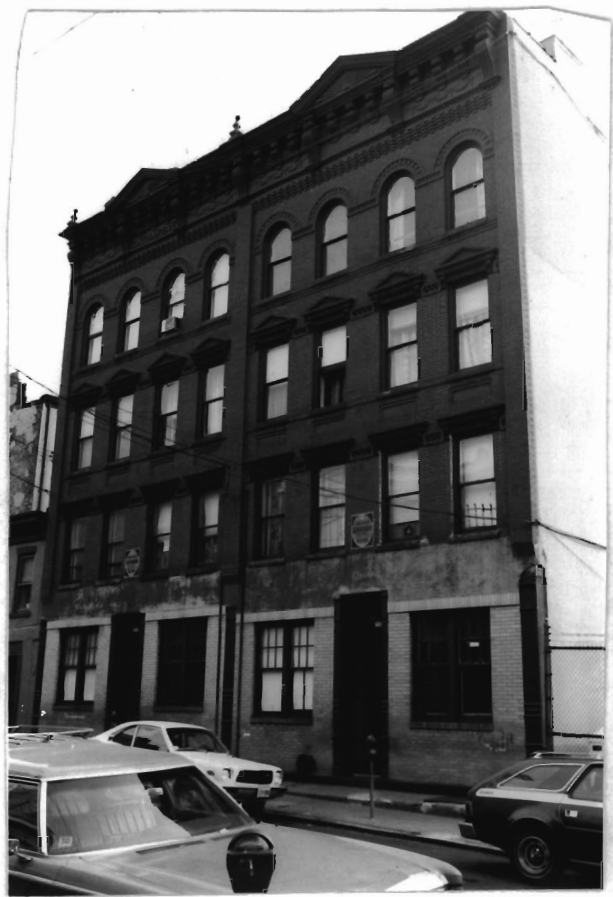
159,161 Newark St. neg. # 20-6