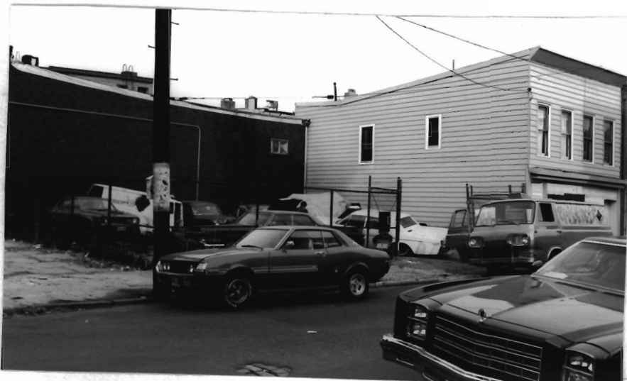
214,212, Newark St. neg. # 20-10