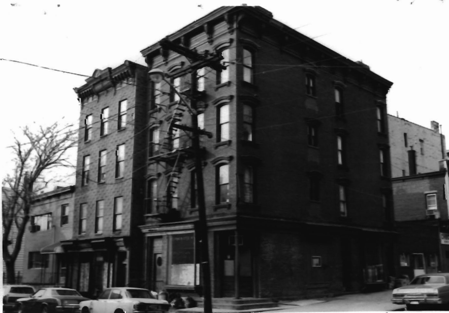
150, 52 NWK (N. S. DE)