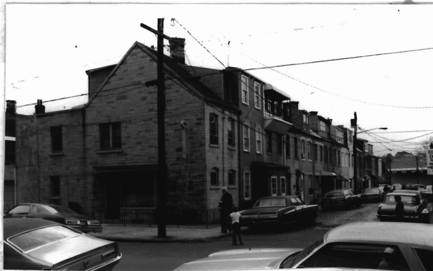
33-63 Willow Court North neg. #: 22-14