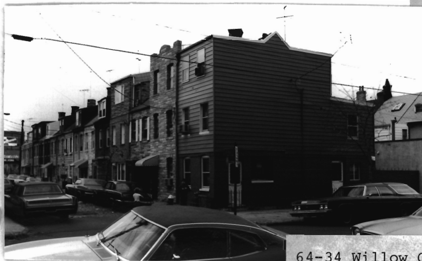
64-34 Willow Court North neg. #: 22-15