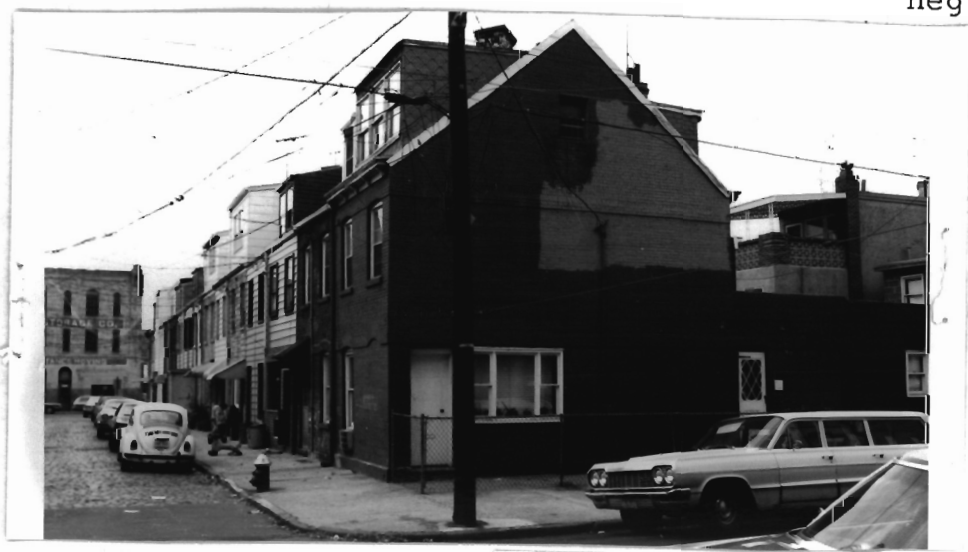
2-32 Willow Court So. neg. #: 22-13