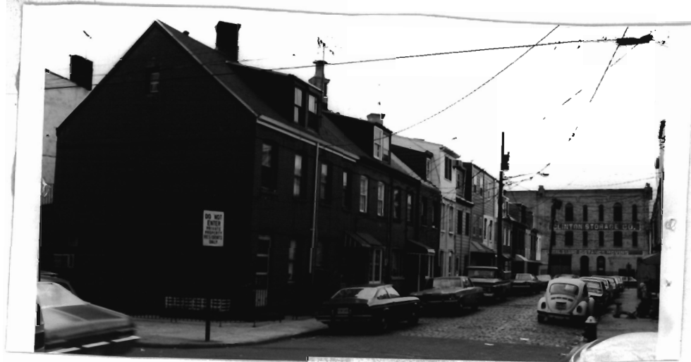
31-1 Willow Court So. neg. #: 22-12