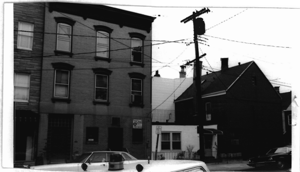
606, 608 (& side of Willow Court) Willow neg. #: 22-3