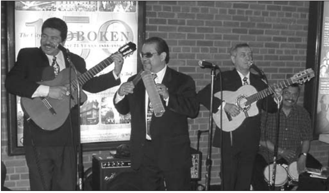
The entertainers for the celebration.