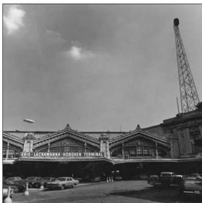
Erie Lackawanna Terminal, Hoboken, NJ

publications. His work has been exhibited at the Soho Gallery, the Susan Caldwell Gallery, and the Nikon House Gallery. He lives in the Bronx.