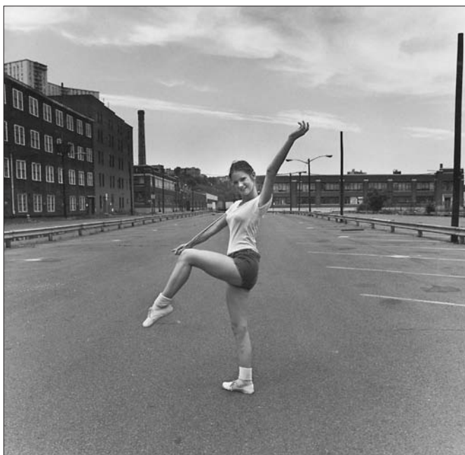
Girl Practicing Her Baton Twirling, Hoboken, 1976