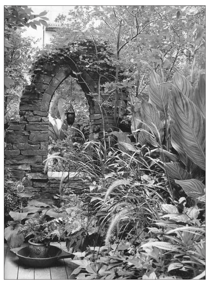
See how Mother Nature—and a gardener's touch—has changed an old favorite on the Tour.