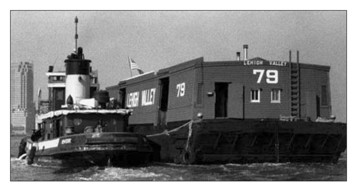
A floating museum visits Hoboken.