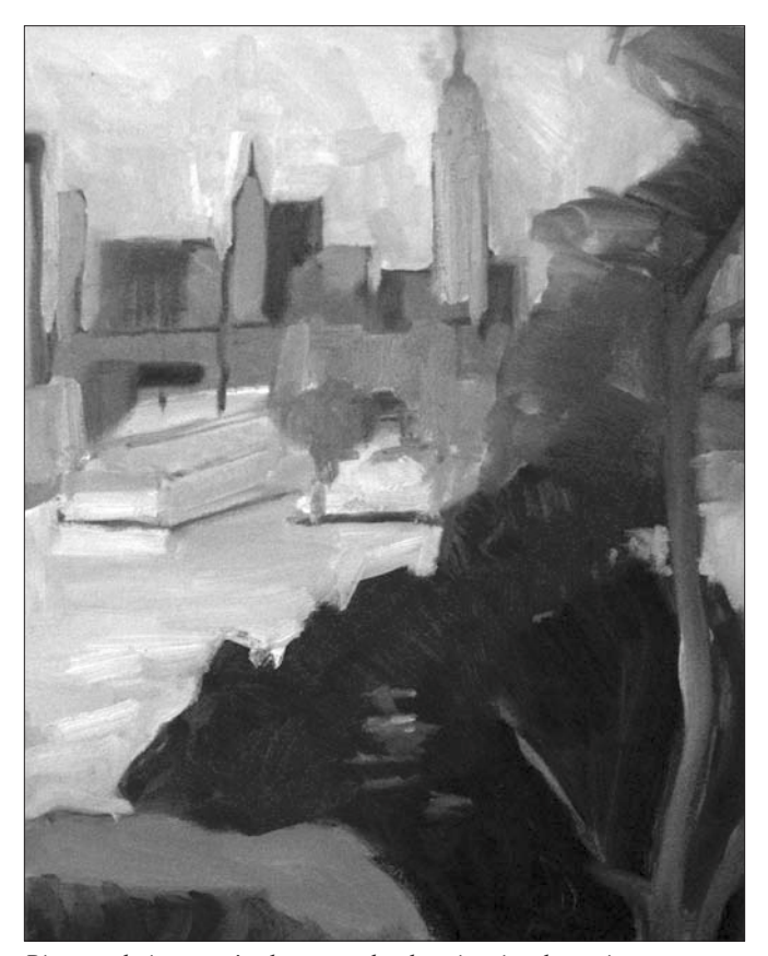
River and cityscape's shapes and colors inspire the artist