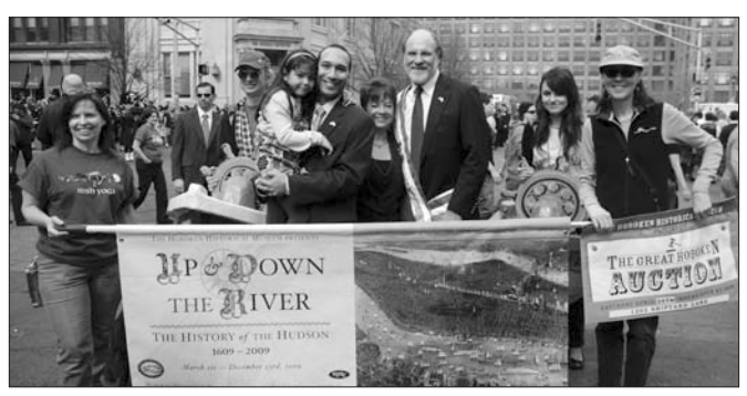
Governor Corzine and State Assemblyman Ruben Ramos support the "River" exhibit.

The Parade's roots extend to the early 20th century. It originated as a way for the public health authorities to identify newly arrived families or families with newborns and to encourage them to take advantage of basic health services.